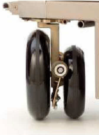
SCWT - Soft Compound