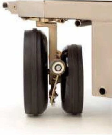
SWT - Soft Wheels